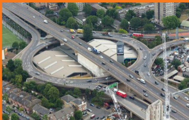
Aerial view of the Westway Sports Centre

The Westway Sports Centre is owned by the Council, leased by the Westway Trust and managed by leisure operator Everyone Active.