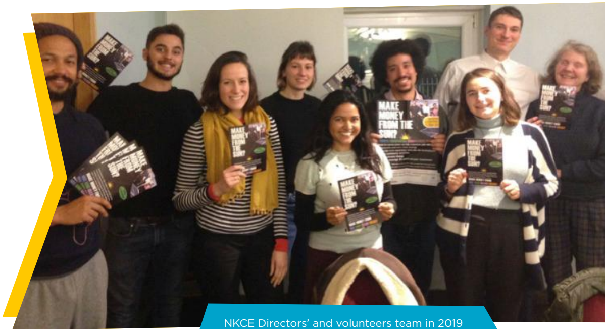
NKCE Directors' and volunteers team in 2019