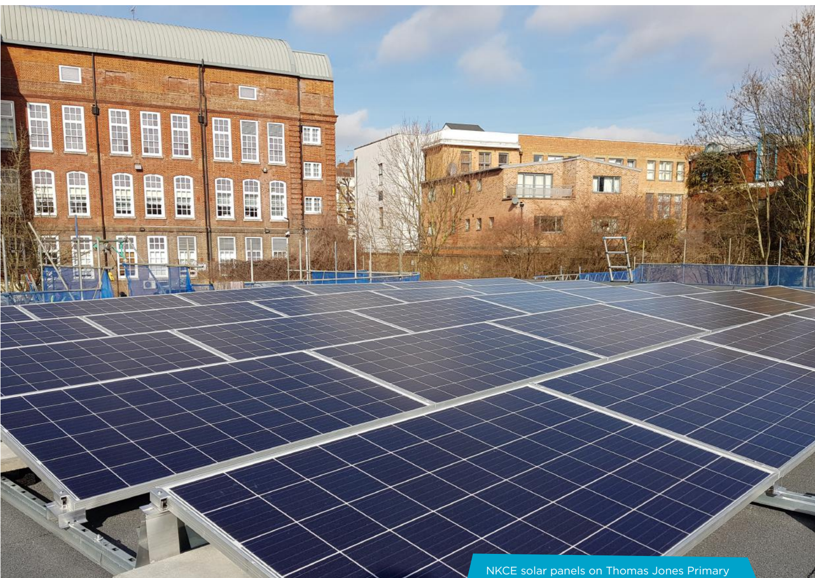
NKCE solar panels on Thomas Jones Primary School, installed March 2019

In 2019, NKCE generated a surplus of £227. According to our forecasts, NKCE will be making a small net loss from 2021 to 2024, after what the Society will generate surplus each year. The financial forecasts tables are to be found in the Business Plan. Our forecasts are based on assumptions. The whole financial model is available on request at info@repowering.org.uk .