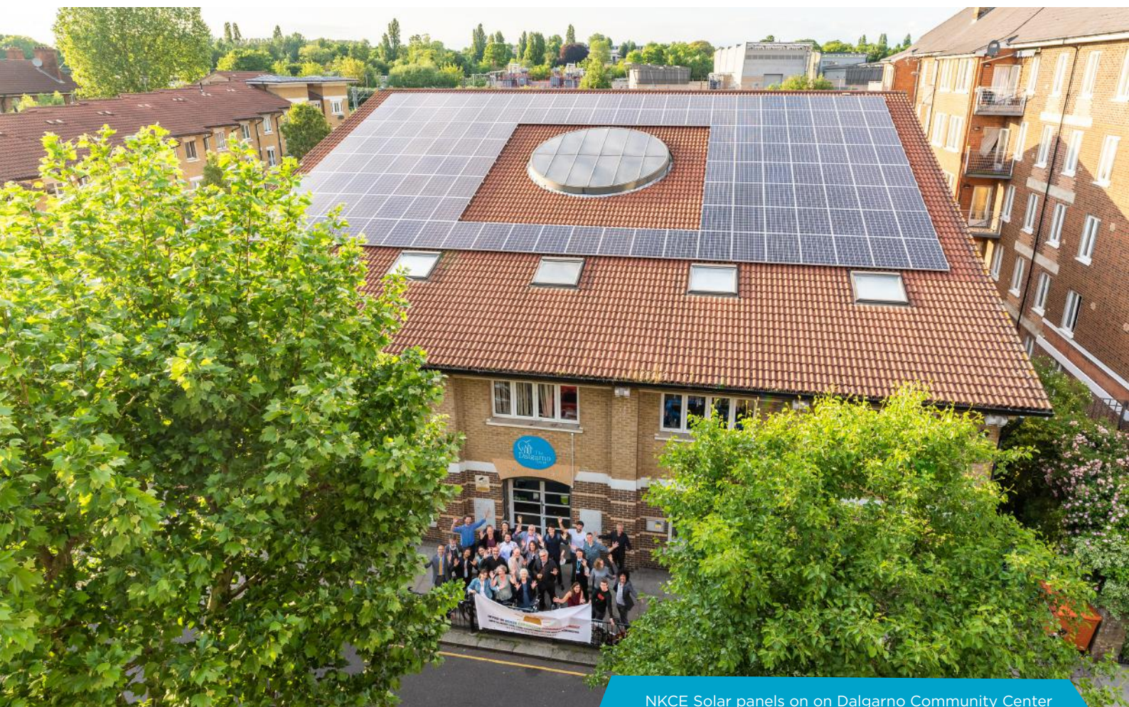
NKCE Solar panels on on Dalgarno Community Center

For this second share offer we already have £15,000 worth of pledges. The minimum investment will be £100, or £50 for residents of the borough under 25 or on benefits, to encourage membership from a wider range of RBKC residents.