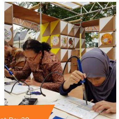
Our solar panel making workshop organised with Repowering at Bay20