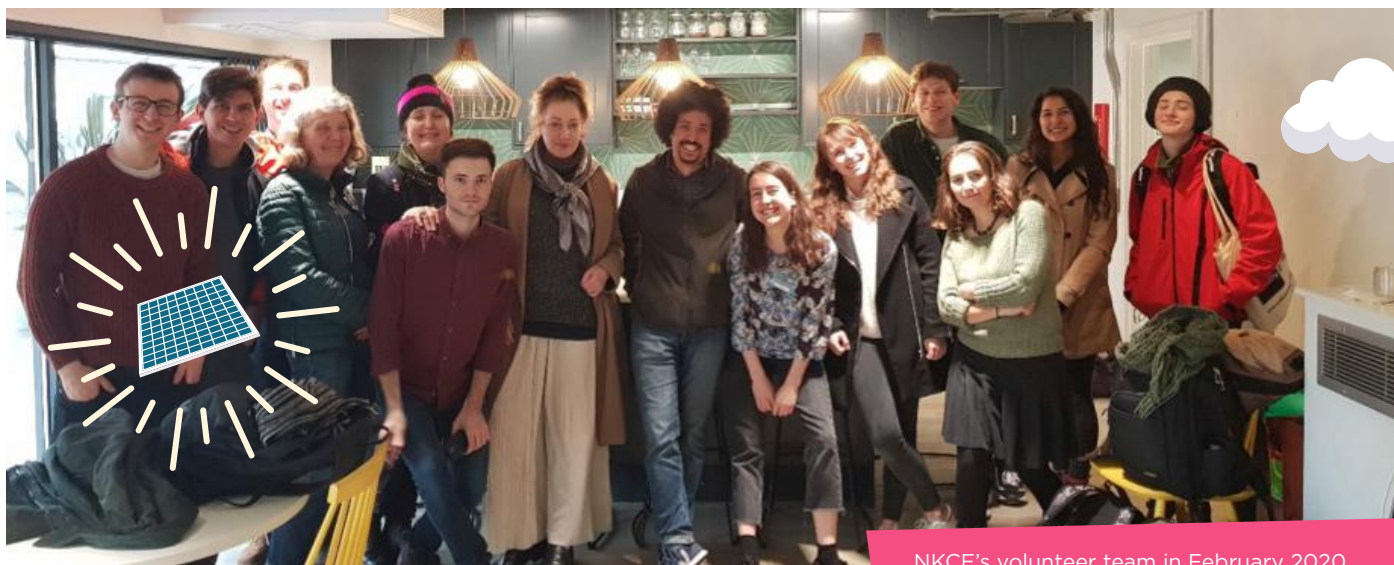
NKCE's volunteer team in February 2020

We work closely with the Climate Change Team from the Royal Borough of Kensington and Chelsea.