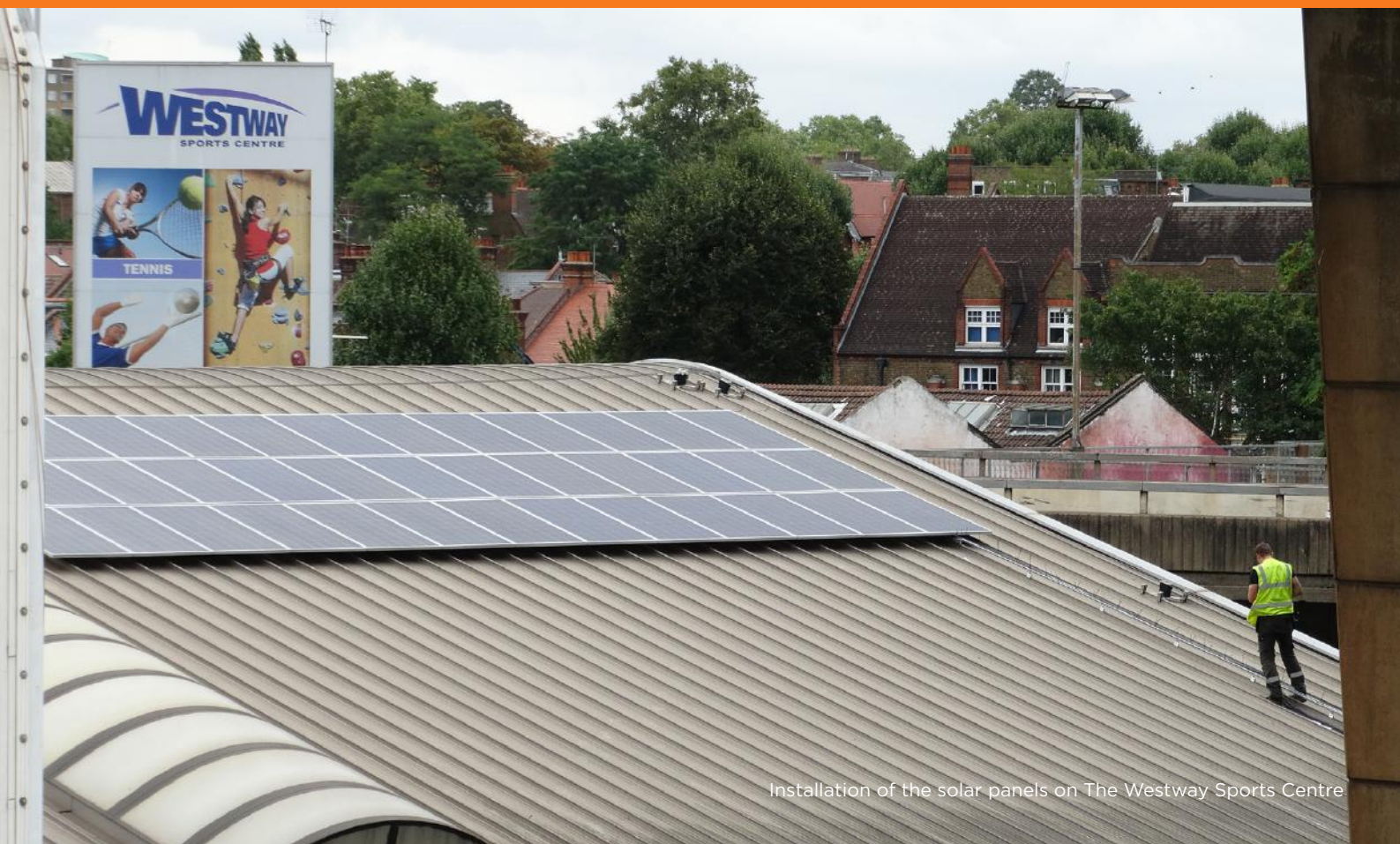
Installation of the solar panels on The Westway Sports Centre